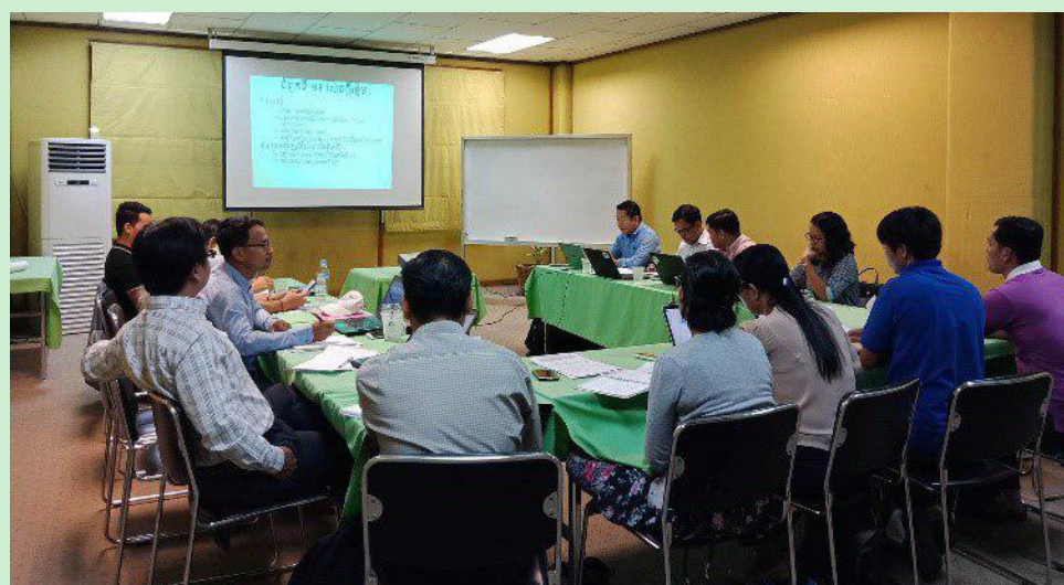
Quarterly RCC Meeting on 26 April 2018

In Cambodia, the Environmental Impact Assessment (EIA) has been required for every proposed private and public projects by the sub-decree on EIA process since 1999. Accordingly, project developers are required to conduct environmental impact assessments and submit reports of their assessment for approval from Ministry of Environment before projects can start. However, there is not a clear guideline on how EIA process should be conducted. In addition, there is no template on what an EIA report should be. As a result, the EIA process and how EIA is reported were dependent on those developed by consulting firms hired by project developers to conduct the EIA. Since June 2016, the Rivers Coalition in Cambodia (RCC) under the coordination of NGOs Forum on Cambodia (NGOF) organized dialogues with the EIA Department of the Ministry of Environment (MoE) to improve in the way EIA is conducted especially in the hydropower sector.