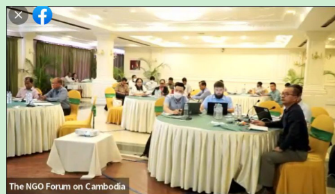
The NGO Forum on Cambodia